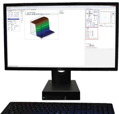
Scanning Kelvin Probe SKP5050 pictured inside standard optical enclosure with PC and software